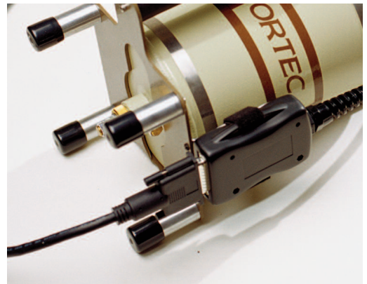
SMART-1 Detector Interface Module.

The DigiDART/SMART-1 combination also guarantees spectrum authenticity. At the start of the acquisition, the DigiDART reads the SMART-1 detector serial number. The DigiDART generates a random number and writes it to the SMART-1 detector. At the end of the acquisition, the DigiDART reads both numbers from the SMART-1 detector and compares the "stop" values to the "start" values. An exact match assures data integrity. Because DigiDART, like all ORTEC MCA products, forms part of the CONNECTIONS architecture, these operations may be carried out remotely over a network, making DigiDART IDEAL for unattended monitoring applications. The combination of the DigiDART and a SMART-1 detector is all that is required to provide full functionality and traceability. The SMART-1 detector includes the module shown in the figure which houses the HV and the detector controller. The cables are captive, strain-relieved and sealed against water penetration, eliminating the high voltage connectors and all the problems of HV connectors.