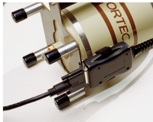
SMART-1 Detector Interface Module.

The DigiDART/SMART-1 combination also guarantees spectrum authenticity. At the start of the acquisition, the DigiDART reads the SMART-1 detector serial number. The DigiDART generates a random number and writes it to the SMART-1 detector. At the end of the acquisition, the DigiDART reads both numbers from the SMART-1 detector and compares the "stop" values to the "start" values. An exact match assures data integrity. Because DigiDART, like all ORTEC MCA products, forms part of the CONNECTIONS architecture, these operations may be carried out remotely over a network, making DigiDART IDEAL for unattended monitoring applications. The combination of the DigiDART and a SMART-1 detector is all that is required to provide full functionality and traceability. The SMART-1 detector includes the module shown in the figure which houses the HV and the detector controller. The cables are captive, strain-relieved and sealed against water penetration, eliminating the high voltage connectors and all the problems of HV connectors.