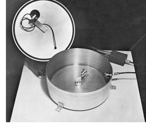
Fig. 15.3. An Example of a Rutherford Scattering Vacuum Chamber.*

*The Rutherford Scattering Chamber incorporates a mount for the <sup>241</sup>Am source with source collimator, a centered holder for a thin gold foil, and a silicon, solid-state detector mounted on an arm suspended from the lid. The arm permits detector rotation through the desired scattering angles. The silicon detector mounted in a fixed position is optional, and can be used for coincidence experiments. The collimator aperture limits the solid angle for alpha-particle emission so that the surviving alpha particles (with the foil removed) fall within the sensitive area of the detector when it is located at a 0° scattering angle. The central foil holder permits rotation of the foil with respect to the incident direction of the alpha particles. The chamber requires a fore pump capable of achieving a vacuum below 200 µm. A vent/pump valve is recommended to make pumping and release of the vacuum convenient without turning off the fore pump. A baffle may be needed in the chamber to prevent rupturing the thin metal foils during rapid pump-down and venting.